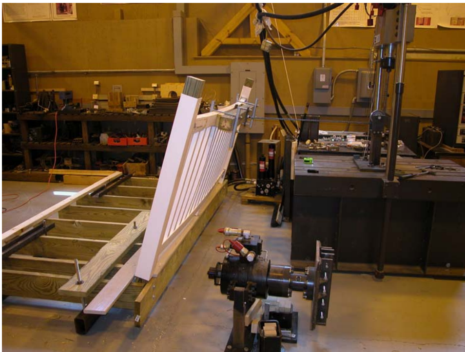
Photo 2: Test in progress showing the deflection of the rail and post just before failure.